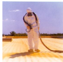
Spray heat insulation