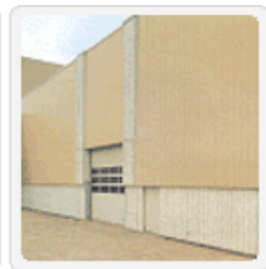
Panels for buildings