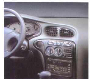
Automobile interior material

COSMONATE SR-550 is widely used in the areas of hard polyurethane – such as panels for the insulation of architectural structures and refrigerators. This product features high viscosity and a high functional group to provide excellent mechanical properties such as compressive strength and bending strength, as well as demoldability, adiabatic property, and incombustibility.